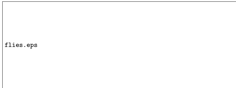
Figure 4: A sample black and white graphic (.eps format) that needs to span two columns of text.