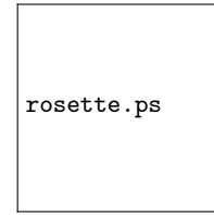
Figure 3: A sample black and white graphic (.ps format) that has been resized with the psfig command.

the command \newtheorem and the other by the command \newdef ; perhaps the clearest and easiest way to distinguish them is to compare the two in the output of this sample document: